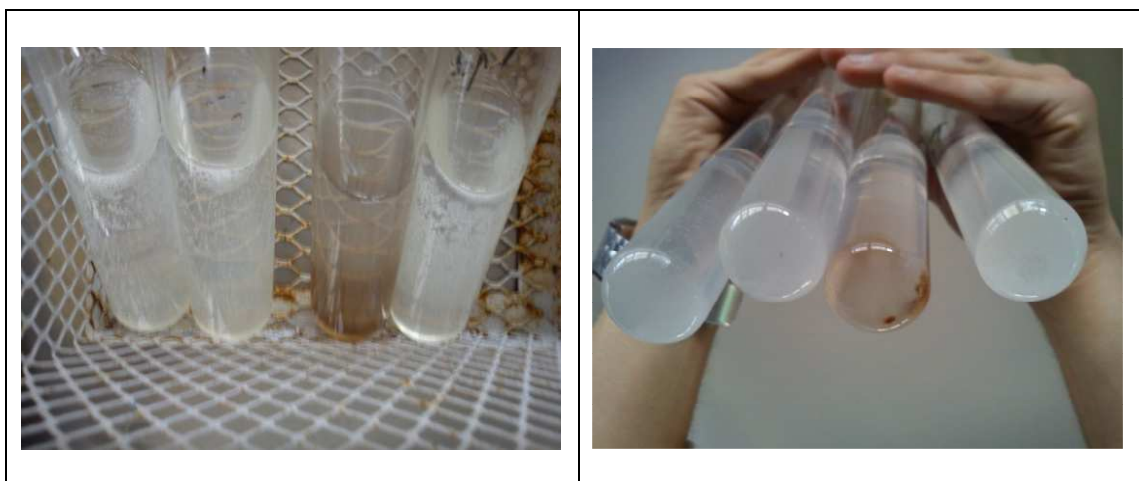
Figure A y B. Reactions samples peroxidase enzyme with 2% phenol, guaiacol, water samples of Lake Chapala and CETI drinking water

Finally results obtained indicate that the presence of peroxidase enzymes exists in the root extracts of B. napus var "turnip", which is involved in the degradation of phenol and that the effect on the degradation of phenol group is effected with high enzymatic activity of approximately 98%. (Figure1).